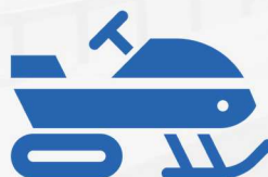
Outdoor Recreation Equipment Manufacturing