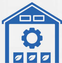
Supply Chain & Logistics Management