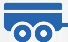
Transportation Equipment Manufacturing