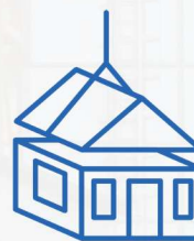
Prefabrication & Modular Construction