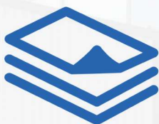
Pulp, Paper & Packaging Production