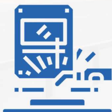
Fabricated Metal Product Manufacturing