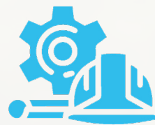
Trades & Technology Businesses