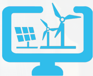
Engineering & Environmental Consulting

With Sunrise Corner's entrepreneurial spirit, positive business climate and incredible rural quality of life, there are significant opportunities within the Small Business & Remote Workers sector for investment, business growth and diversification.