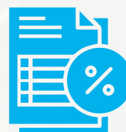
Finance & Accounting