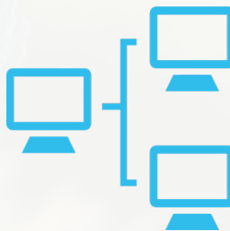
Online Enterprise Support Services