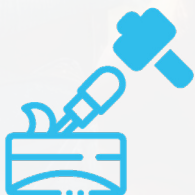
Artist & Artisan Businesses