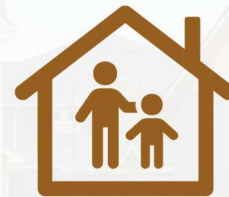
Child Care Facilities